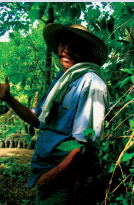
FIGURE 3 A farmer in Colombia's Quindío region with the seedlings he is about to plant on his farm.

ly to be site-specific. As with biodiversity benefits, these benefits will generally not be included in land users' decision-making.