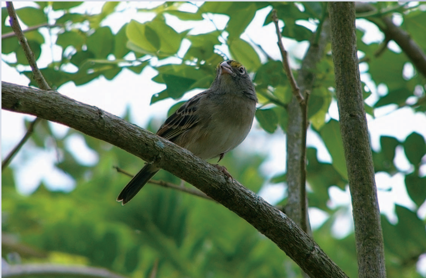
FIGURE 2 Coal miners have their canary, and the Silvopastoral Project has the sabanero grillo ( Ammodramus savannarum ). This critically endangered species was observed in a live fence planted under the Project in Quindío, Colombia.