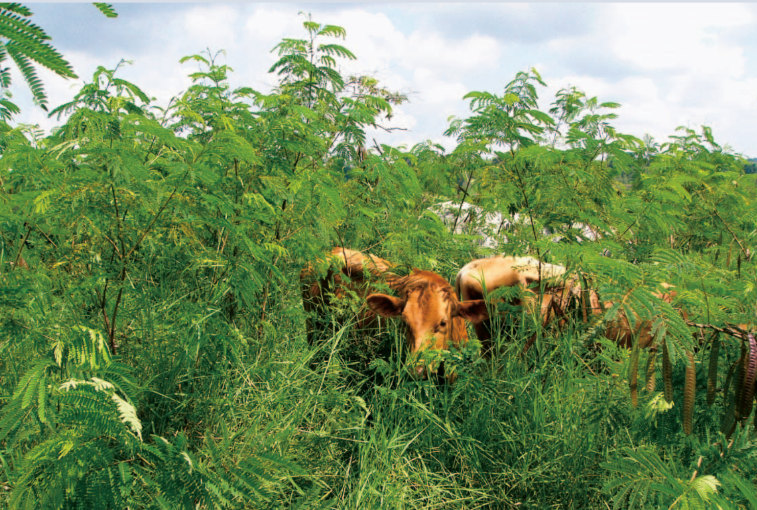
FIGURE 5 Silvopastoral practices introduce a variety of tree species in pasture. Here, cattle graze in an intensive leucaena or leadtree ( Leucaena leucocephala ) system in Quindío, Colombia. Such systems can be more productive and can harbor much higher levels of biodiversity than the extensive pastures they replace. However, high initial costs often make them financially unattractive to land users.

diversity than current monocultural, treeless pastures. Figure 6 shows initial data from biodiversity monitoring at the Costa Rica and Nicaragua sites. These results show that land used under a silvopastoral system harbors higher levels of biodiversity than treeless pastures. The observed diversity of bird species, as well as the number of individuals (not shown in Figure 6), is greater on land with trees, and higher yet when the tree density is higher. Similar results are being obtained for other indicators (vegetation, ants, and butterflies).